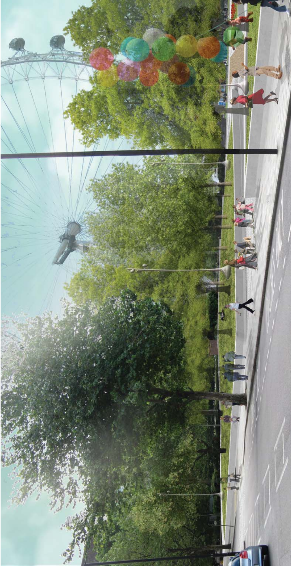
JUBILEE GARDENS DESIGN: SUBSTITUTE ITEMS AND PHASED ELEMENTS STATEMENT