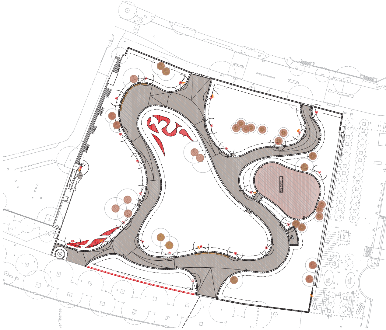
Figure 2 Development Proposal (Indicating Substitute Items/Phased Elements) . Scale 1:800@A3