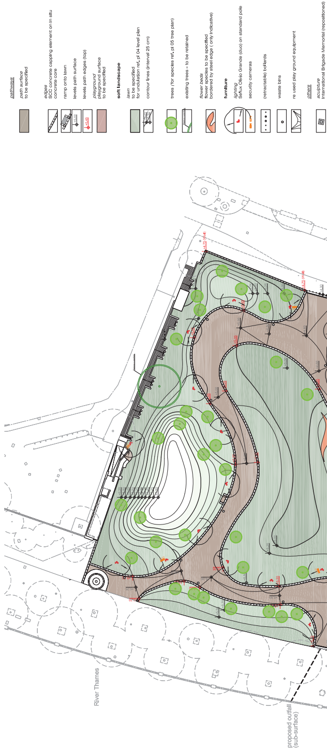
Figure 1 Development Proposal: Proposed Layout (Excluding Substitute Items/Phased Elements). Scale 1:800@A3